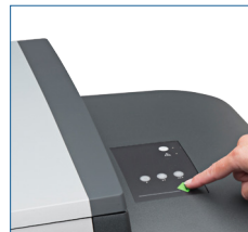
One-touch scanning: The entire image in just 4 seconds