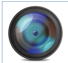
One camera, one perfect image, no stitching