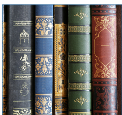
Odd-size items – books