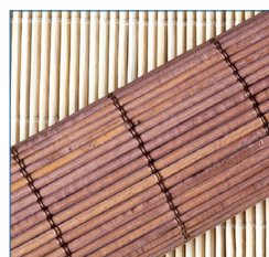
Wood, bamboo and similar