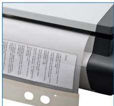
Oversize document scanning

The large flatbed surface provides great flexibility for creativity, careful document handling, oversized and book scanning.