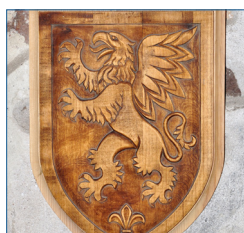
Odd-size materials – carvings