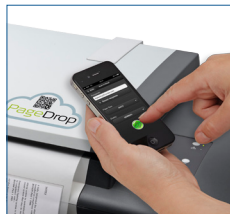
Cloud enabled with PageDrop